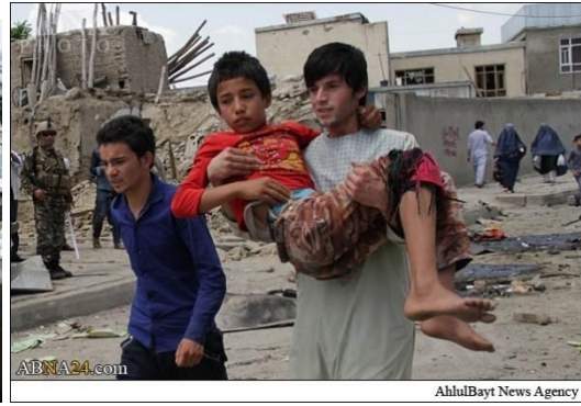
AhluBayt News Agency